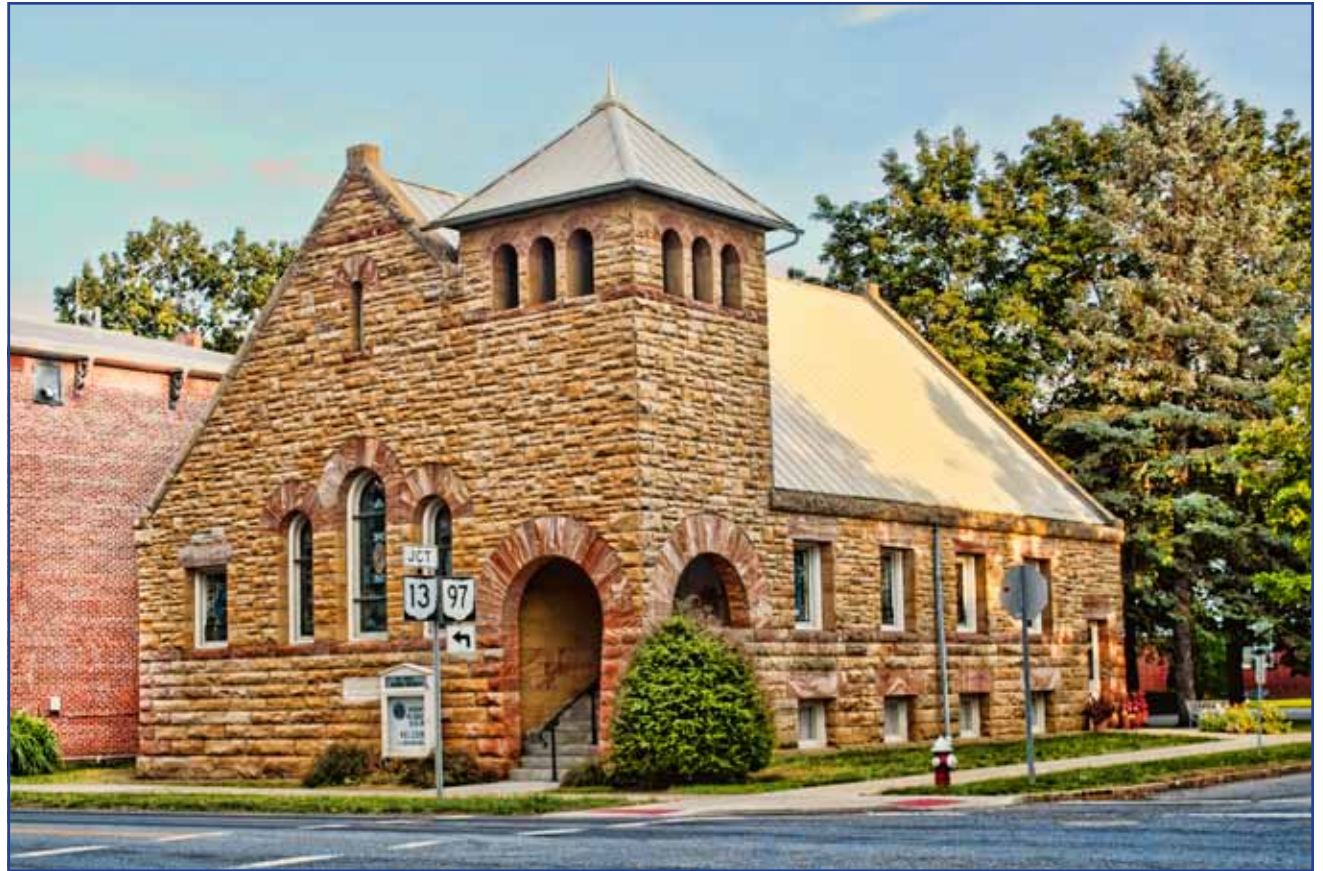
On August 25, work started on cleaning the sealing the church and WOW does the front look great. Compare that to pictures taken just last year from about the same angle (below).