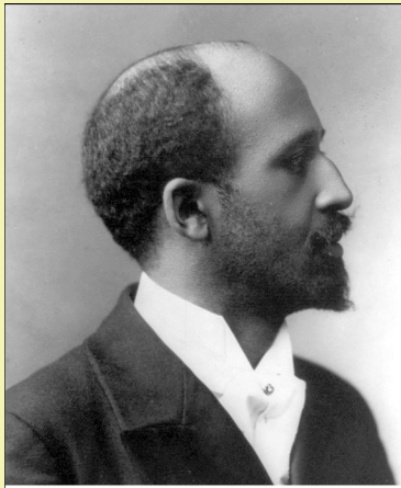
The Souls of Black Folk W E B DU BOIS